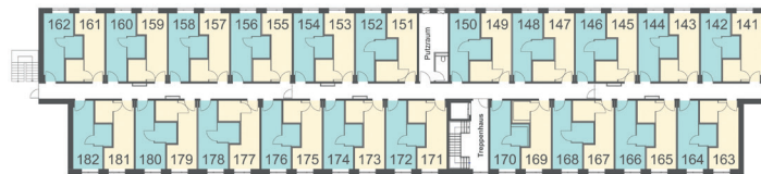
Hauptstr. 52 (building 2)