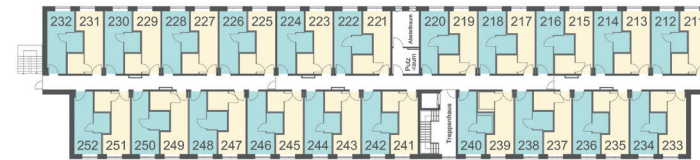
Hauptstr. 52 (building 2)