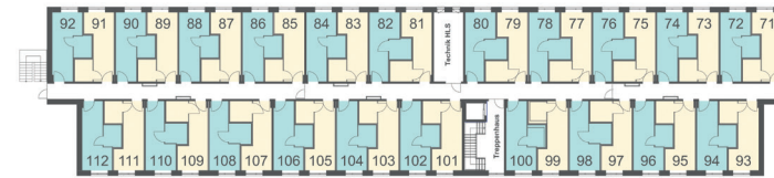
Hauptstr. 52 (building 2)